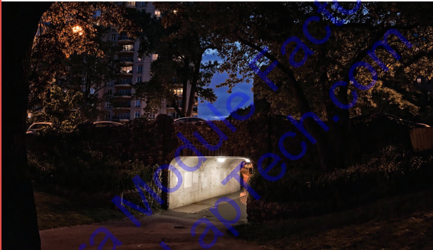
Image Sensor Combines Ultra Low Light and Nyxel™ NIR Technologies for Industry's Best Nighttime Camera Performance

lead free available in a lead-free package